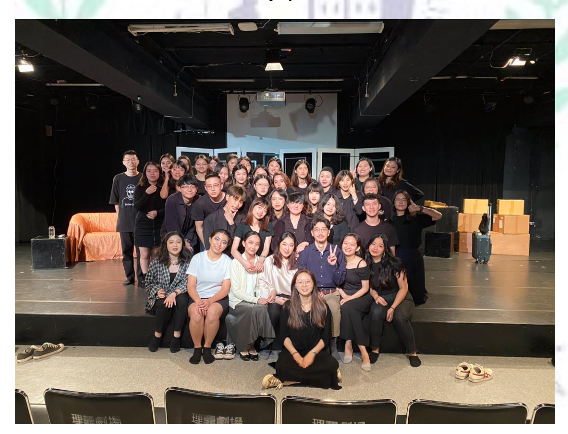
Figure 1. The crew of Frozen

In the 2020 Annual Play Frozen , I played Nancy, a mother whose daughter was killed by a serial killer. This was my first time in the theatre, and it had been a wonderful and challenging journey for me. The process of exploring, understanding, analyzing, and finally acting as Nancy, was very unforgettable. I had grown and learned a lot through acting and working with these incredible and creative people. The results and all the feedback were all worth our four-month dedication to this play and theatre.