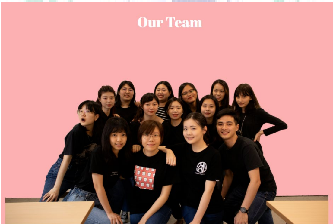
Staff members of 2021 Department Magazine