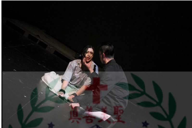
<2019 Annual Play – Vinegar Tom – Alice and Packer>

the light, the props and the actor were all in one and had formed a perfect vibe to make the audience experience the sad and tragic lives of these women.