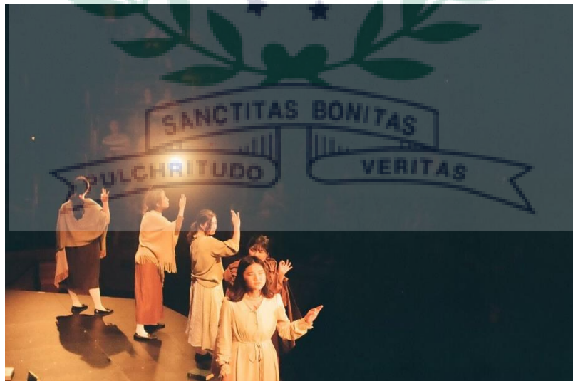
<2019 Annual Play – Vinegar Tom – Singing Evil Women >

Unlike being in the chorus, this time I needed to sing alone and dance at the same time. It was pretty hard but I really enjoyed the moment on stage. Acting, singing and dancing with my crew and cast was one of the most precious experiences in my college life.