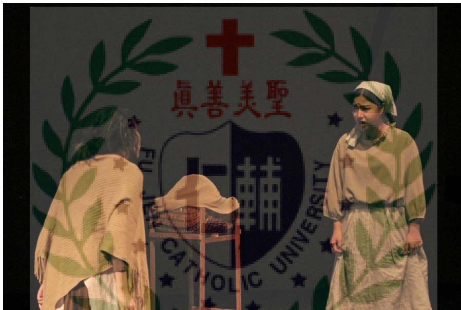
<2019 Annual Play – Vinegar Tom – Alice and Joan>