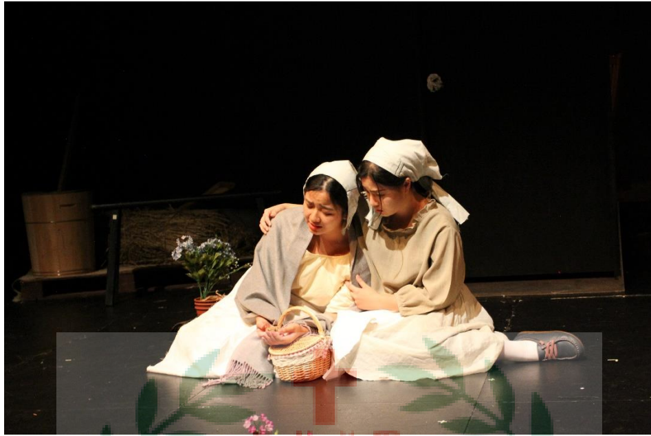
<2019 Annual Play – Vinegar Tom – Alice and Susan>