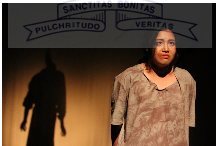
<2019 Annual Play – Vinegar Tom – Alice>

I really made lots of efforts while rehearsing the dead scene of mine. My monologue was really difficult since it contained complicated emotion. That was Alice's last words to curse those who had hurt her and her family and that also showed her hopelessness because of the betrayal of her best friend and her mother's death.