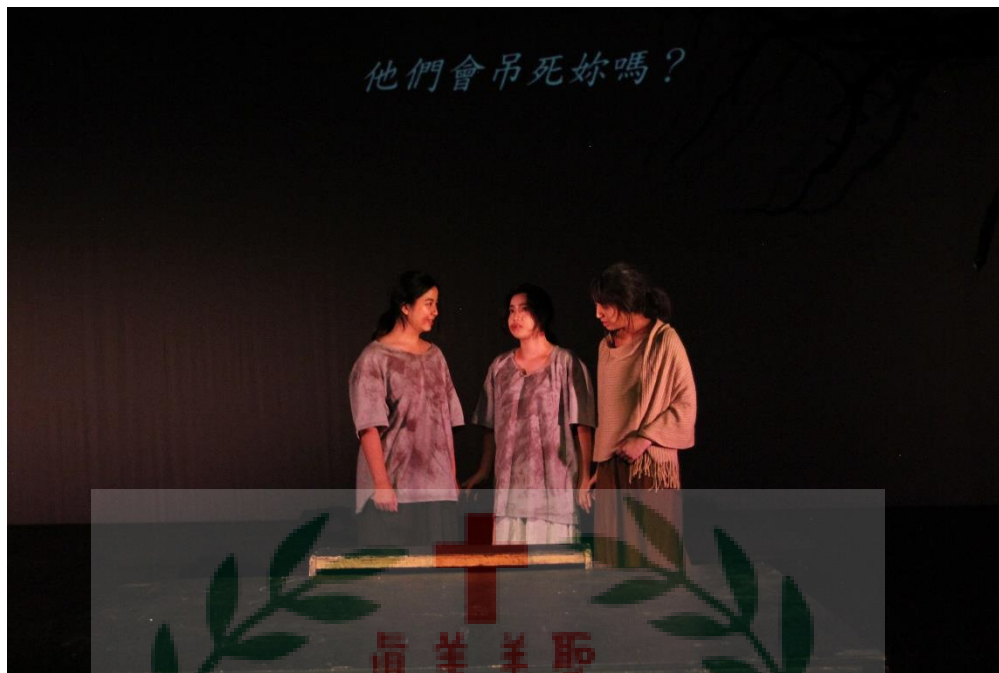
<2019 Annual Play – Vinegar Tom – Singing Lament for the witches >

Unlike being in the chorus, this time I needed to sing alone and dance at the same time. It was pretty hard but I really enjoyed the moment on stage. Acting, singing and dancing with my crew and cast was one of the most precious experiences in my college life.