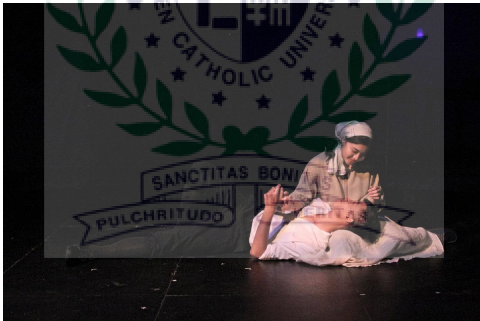
<2019 Annual Play – Vinegar Tom – Alice and the Man>

This character was much more challenging for me because compared to the role last time, I got to interact with other actors more. For example, in scene 1, I had to act like a little girl asking for more love and also to enjoy the cuddling with the male character, which made me feel a little bit awkward. However, with practicing over and over again and the instruction from the director, I had overcome the obstacle after all.