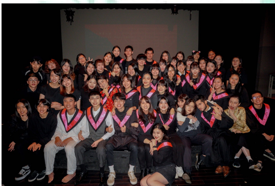
One Big Family Thank you guys!