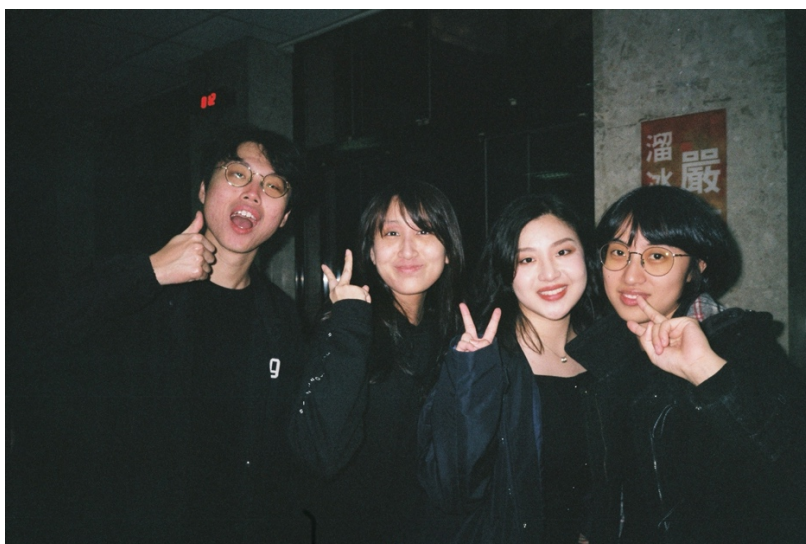
The Earliest Crews♥□