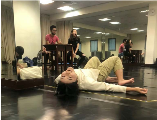
Actors are funny and weird and cute