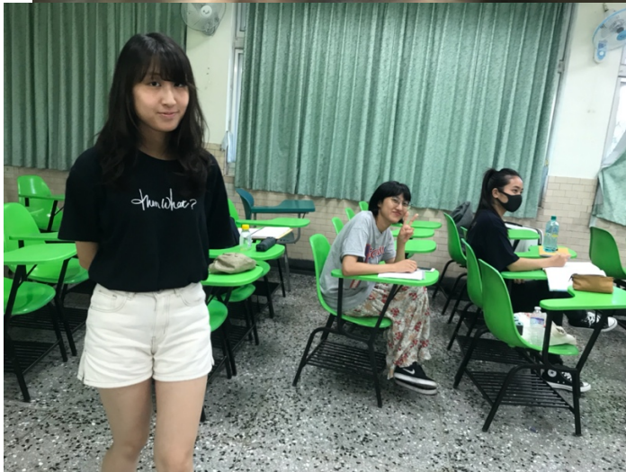
Director and Assistant director