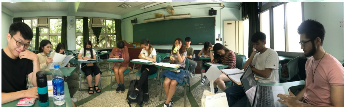
First meeting with actors-discussing the play