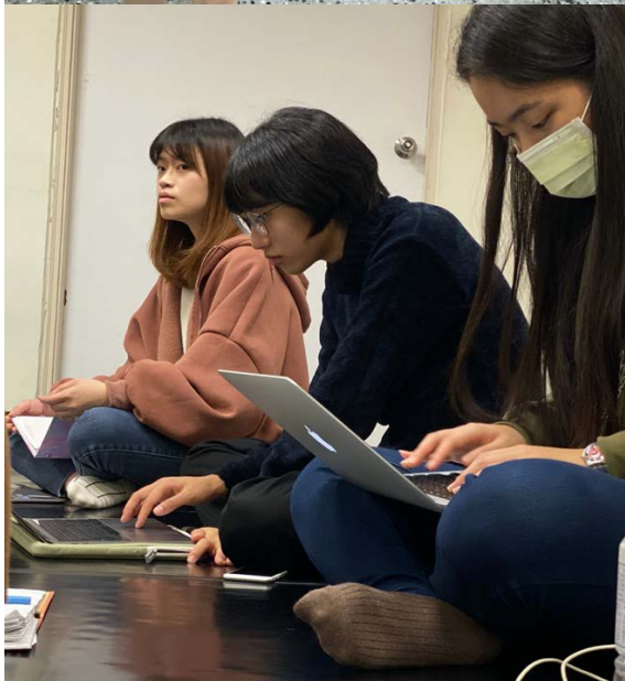
Assistants working aside