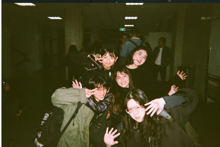
Joining SP with best friends is Fun