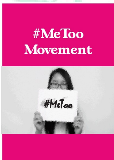
▲ “#MeToo Movement” cover page

the use of words. As I am not a native English speaker, there are chances that I could get confused with the correct usage of words. In order to make the article natural and professional, I put every phrasal verbs, phrases and even vocabulary that I was not sure about the correct usage into Google search to search for articles that also contained these words and see how native speakers use these words even though I have known their definitions in Chinese. In addition, the logic of the article was another challenge for me. Since everyone was an individual, each of us would have our own way of thinking; and I understood that there was no definite answer of whose way of thinking, organizing paragraphs was more correct. As a result, when finding out there was something illogical or could be re-organized to make it clearer, I usually hesitated to correct it because I was worried about whether it was really a problem of logic or it was just a different way of thinking from mine. The way I dealt with this was to highlight, instead of directly crossing it out, the parts I thought not logical and left my opinions and comments then let the writer to decide which one was better.